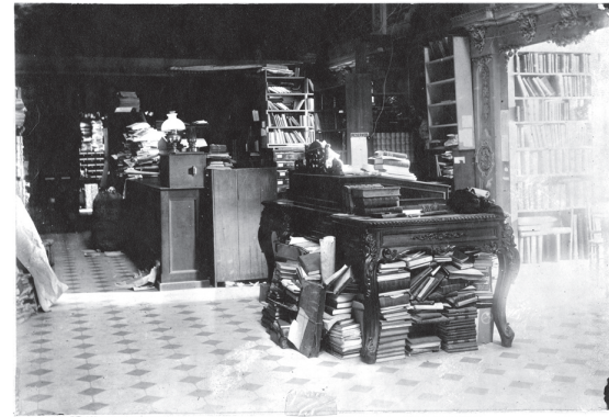
The Copyright Office and deposits as it appeared in 1898

law, with the great additional labor and responsibility involved, suggests the necessity of increased assistance being